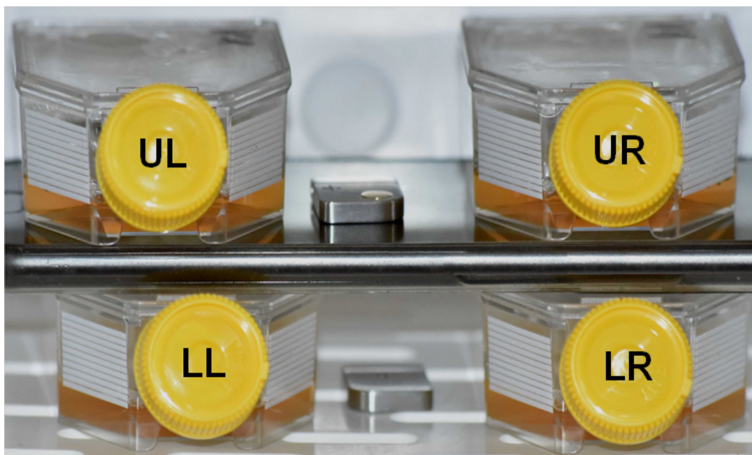
Figure 1. Experimental setup during exposure with quadruplicate samples placed on the mobile phone display (= direction of radiation towards the user) and placed beneath its back cover (= direction of radiation away from the user). QiOne® 2 Pro was placed between the culture flasks at each radiation level. The positions of the flasks are marked as UL (= upper left), UR (= upper right), LL (= lower left), LR (= lower right).